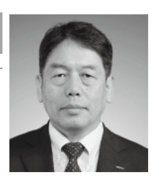
Number of the Company shares owned: 9,800 shares Term of office at the conclusion of this GSM: 4 years Attendance to the meeting of the Board of Directors: 12/12 (100%)