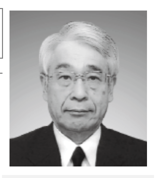
Number of the Company shares owned: 0 shares Term of office at the conclusion of this GSM: 0 years Attendance to the meeting of the Board of Directors: 0/0 (0%)