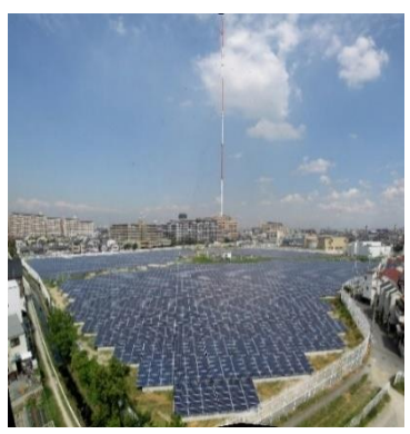
Solar panels at Takaishi Radio Transmission Station

Launched in November 2013, the Takaishi Radio Transmission Station project in Takaishi City, Osaka, entered its ninth year in fiscal 2021. Approximately 10,000 solar panels have been installed (1,990kW generation capacity) on an approximately 29,000m<sup>2</sup> site. The electricity generated by the project is provided to the market through Kansai Electric Power. For example, in fiscal 2020, the project provided the equivalent of approximately 27.3% of the electricity used in the Asahi Broadcasting Group Holdings headquarters building. Through the creation of green power in this way, the group aims to become an environmentally considerate and Earth-friendly broadcasting company.